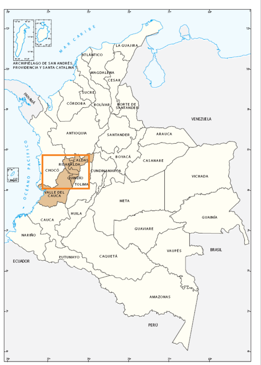
Location within Colombia