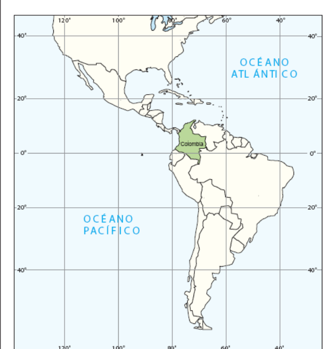
Location within Latin America