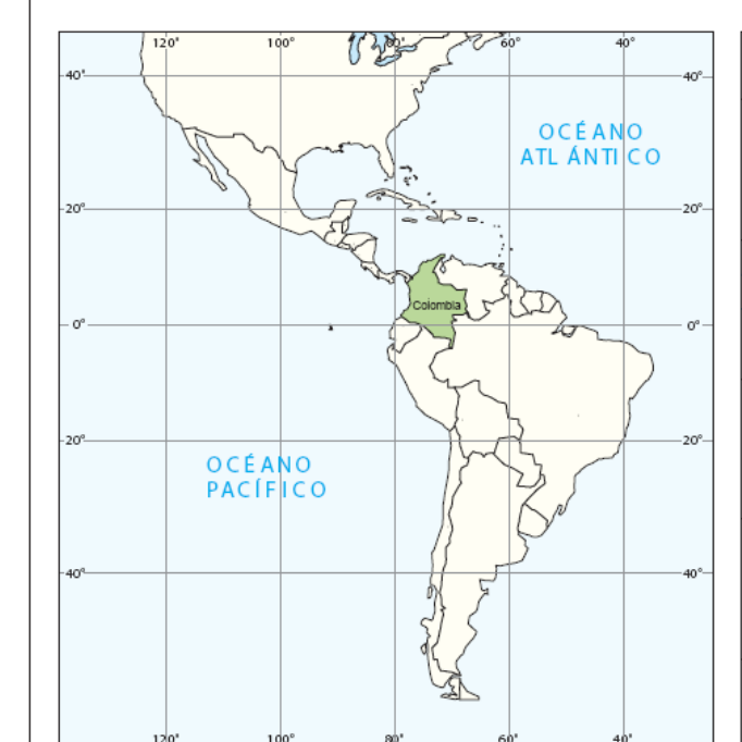
Location within Latin America