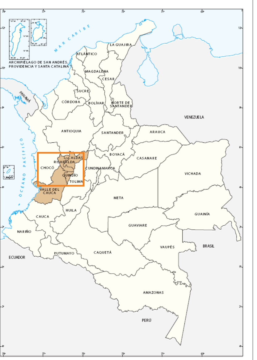
Location within Colombia